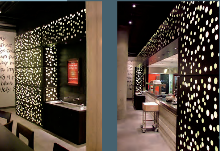
Nandos Restaurants, Manchester

Then, of course, there's desire to create a strong visual impact.