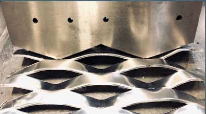
Project: Techspace One, Daresbury