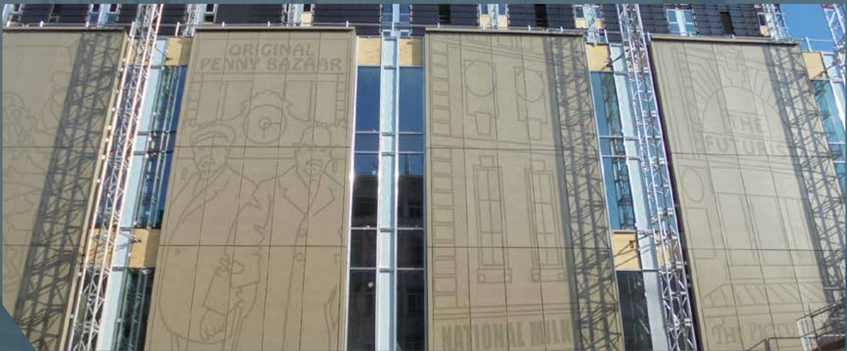
Project: Liverpool Lime Street, Liverpool